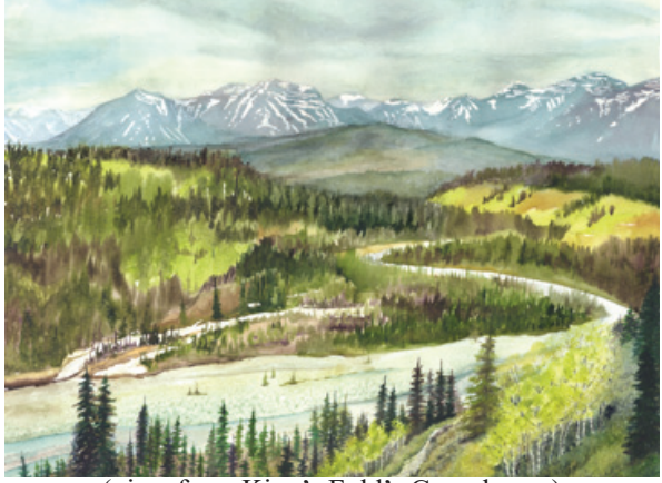
(view from King's Fold's Greenhouse)

Location: about a one hour drive from Calgary, Alberta, 35 kilometers northwest of Cochrane.