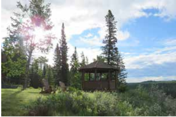
(King's Fold's Gazebo in the Morning)

Location: about a one hour drive from Calgary, Alberta, 35 kilometers northwest of Cochrane.