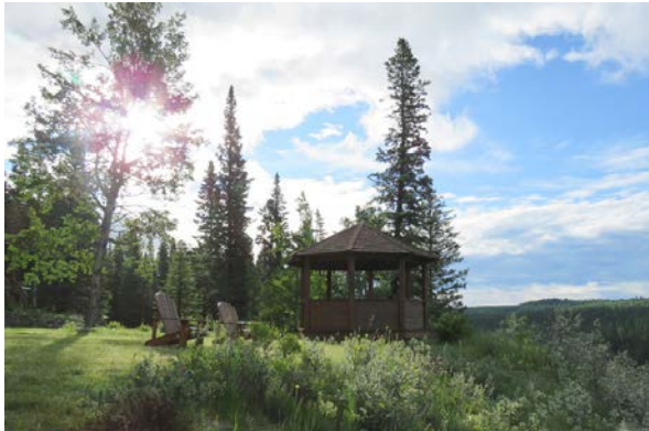
(King's Fold's Gazebo in the Morning)

Location: about a one hour drive from Calgary, Alberta, 35 kilometers northwest of Cochrane.