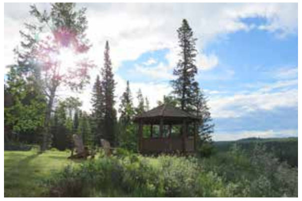
(King's Fold's Gazebo in the Morning)

Location: about a one hour drive from Calgary, Alberta, 35 kilometers northwest of Cochrane.