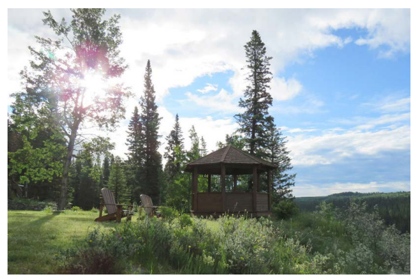
(King's Fold's Gazebo in the Morning)

Location: about a one hour drive from Calgary, Alberta, 35 kilometers northwest of Cochrane.