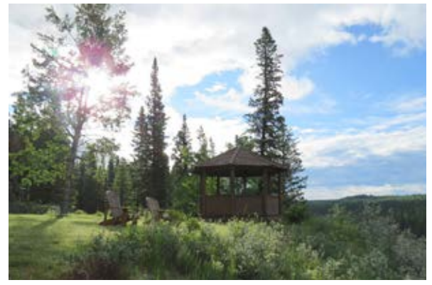
(King's Fold's Gazebo in the Morning)

Location: about a one hour drive from Calgary, Alberta, 35 kilometers northwest of Cochrane.