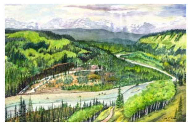
(view from King's Fold's Greenhouse)

Location: about a one hour drive from Calgary, Alberta, 35 kilometers northwest of Cochrane.